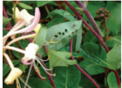
Larval leaf damage on honeysuckle