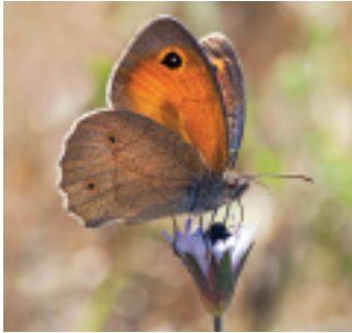
Aegean Meadow Brown