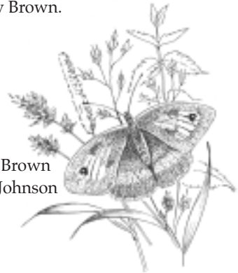
Meadow Brown

The meadows have been sown in specially designed low-nutrient soil, with a high sand content, to ensure a diverse mix of flowers and to discourage weeds. After the Games the meadows will gradually incorporate a range of grasses, naturally and through oversowing, so they become self-sustaining and support particular butterfly larvae such as Meadow Brown.