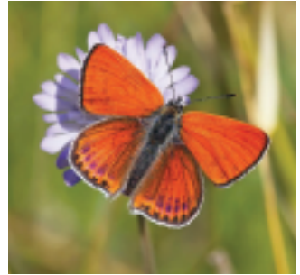
Lesser Fiery Copper